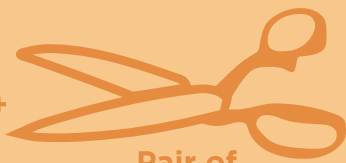
Pair of Scissors