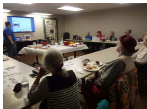
Coins for Change Program