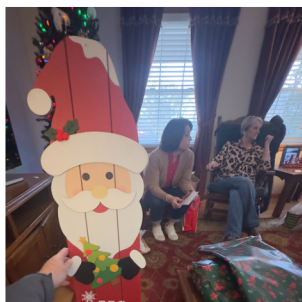
Sano Stars Holiday Party

The January 2025 Homemakers Newsletter is packed with important updates, exciting events, and helpful information to kick off the new year. One of the featured highlights is the Cultural Arts Competition, which encourages members to showcase their creativity and skills. Members are reminded to start preparing their entries, as this annual competition is an excellent opportunity to celebrate the rich talents within the Homemaker community. The newsletter includes detailed guidelines on how to participate, as well as a list of categories to ensure everyone has a chance to shine.