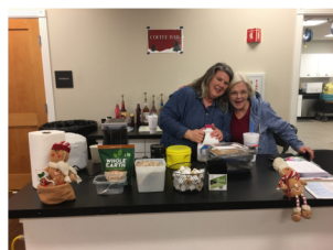
The Coffee Bar at the Holiday Bazaar