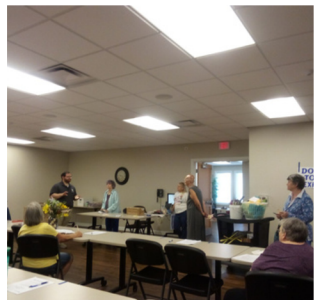
Volunteers assist with Floral Hall Check-in

In the September 2024 Adair County Extension Homemakers Newsletter, I wanted to share some exciting updates and events that are coming up this month. We've got a lot going on, and I hope you'll find something that sparks your interest. For starters, we will be offering a Self-Care Workshop on September 17th, where we'll be diving into ways to prioritize our mental and physical well-being. It is part of the KEHA Self-Care Program, and is about taking a moment to focus on ourselves—something we all need to do more often.