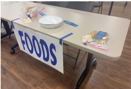
Food Entries at the Fair