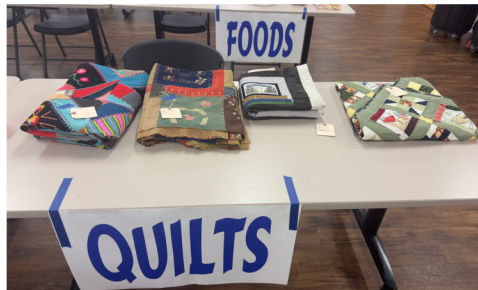
Quilt Entries this Year